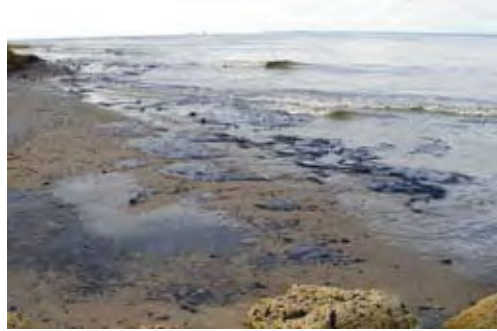
Photo: November 12, 2007, oil patches on the Tuzla Spit, http://www.flickr.com/photos/ .