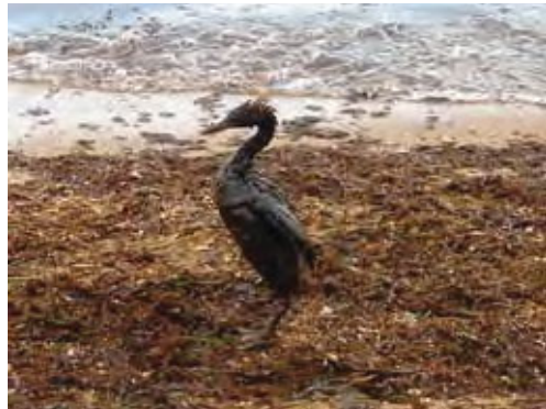
Photos: A birds stained with fuel oil sits at the shore near Russia's port Caucasus