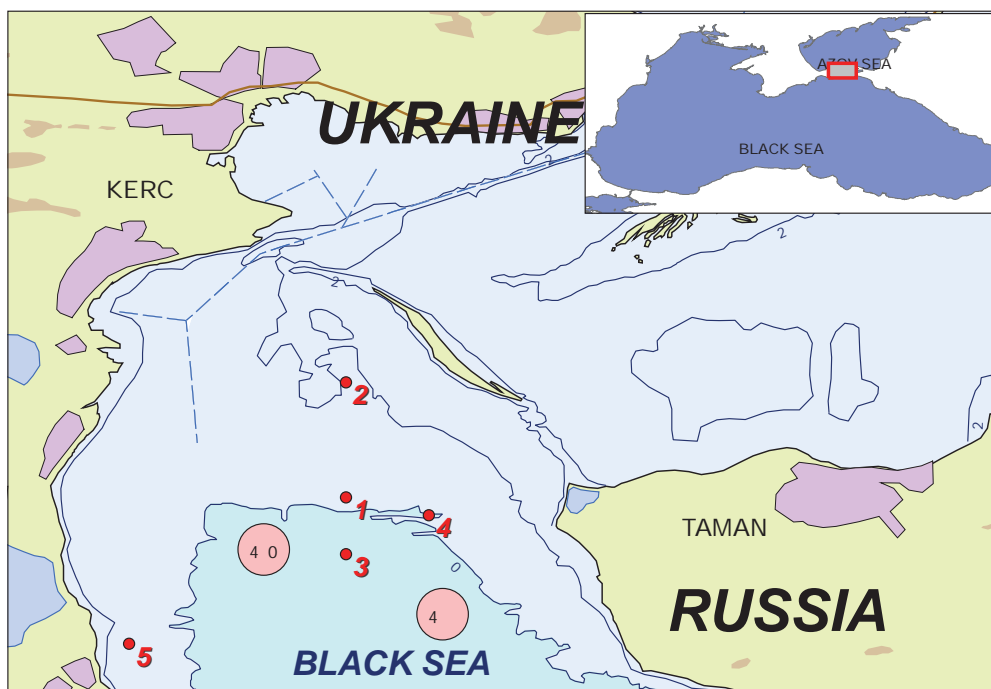
Fig. 2. Map of the areas where the ships sank in the Kerch Strait on 11 November 2007: the Volgoneft-139 tanker bow (point 1) and stern (point 2; 45°15'5 N and 36°31'8 E), Volgoneft-123 (3; 45°11'6 N and 36°31'8 E), Nahichevan (4; 45°12'0 N and 36°33'3 E) and Kovel (5; 45°09'1 N and 36°26'6 E). Transshipment areas Nos 450 and 451 are marked in red.

The other motor vessels of Volnogorsk (loaded with 2437 t of granulated sulfur), Nahichevan (2366 t) and Kovel (1923 t) did not sink immediately, but drifted towards the coast of Ukraine to the South from the Tuzla Island. It was later reported that the sulfur granulates discharged to the sea floor had been leaked from the Kovel motor vessel. The m/v Volnogorsk sank at 45°11'6 N and 36°31'8 E at the depth of 11 m. All the crewmembers (8 persons) left on the life raft. The Neptunia sea tug (Ukraine flagged) was sent to the life raft. The Nahichevan motor vessel sank at 45°12'0 N and 36°33'3 E; Kovel sank at 45°09'1 N and 36°26'6 E (Fig. 2).