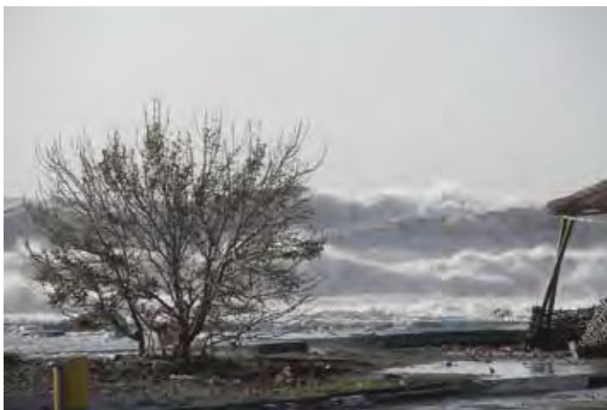
Photo: The high waves nearby Novorossiysk on 11 th November 2007, by Alexander Kuznetsov .

The SAR (search and rescue) operations were unique, dangerous and difficult due to the gale wind up to 35 m/s and heavy waves. Russian and Ukrainian SAR units were engaged in real self-denial operations. Helicopters could not take part in rescuing people due to the stormy weather conditions. Despite of all, 35 crewmembers