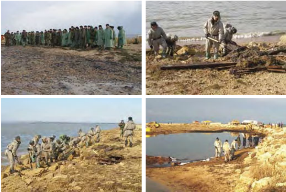
Military forces and volunteers engaged in clean-up operations on the coast

tion, the expectations emerged that the consequences of the accident would be felt for several years on — environmentally and socio-economically. A number of public institutions and agencies jointly with commercial companies got engaged in determining the damage inflicted on the ecosystems. Their produced figures and numbers were enormous and varied by more than three orders of magnitude to range from tens of millions to hundreds of billion roubles, while Ukraine was initially about to claim billions of USD from Russia in compensation for its sustained damage.