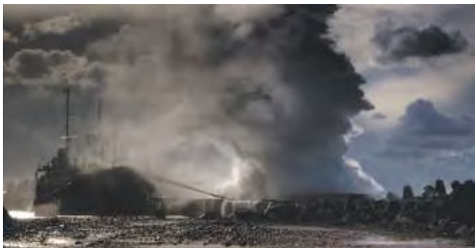
Photo: The storm on 11 th of November, 2007

5.4 m height and arriving from the Black Sea were taking tankers and dry-cargo carriers away from their anchors to wash them aground at the Kerch and Taman Peninsulas. In total, thirteen boats 3 suffered an accident as a result of the storm, and of them four dry-cargo carriers and one tanker sank 4 (Fig. 2).