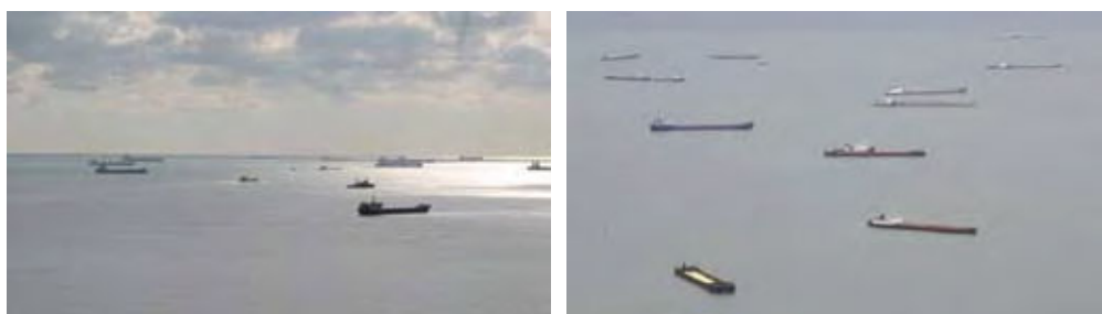
Photo: Berths and a queue of ships at anchorage in the southern part of the Kerch Strait (Booklet, 2009).

from four ships had been salvaged and hospitalized. Eight people from the sunken vessel Nahichevan did not survive — four sailors were found dead on shore two days later, four went missing.