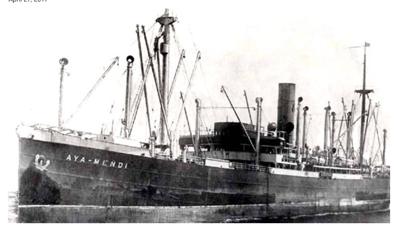
Cargo ship "Kharkov" (Boy Feddersen), which sank off the coast of the Crimea in 1943

ukropnews24.com /in-crimea-the-invaders-found-the-sunken-steamship-kharkov-which-the-nazis-took-out-treasure/newsmaker April 27, 2017