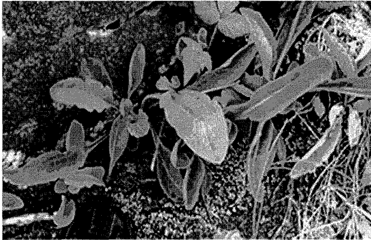
Photo 1. Prenanthes racemosa (Glaucous Rattlesnake-root) growing on a rock ledge on the White's Cove property.