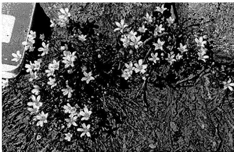
Photo 2. Arenaria groenlandica (Mountain Sandwort) in shallow soil on the edge of a coastal basalt outcrop, northeast of White's Cove.