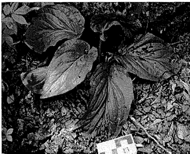
Photo 5. Symplocarpus foetidus (Skunk Cabbage) in woods northeast of White's Cove Road.

Only one plant of Skunk Cabbage was found during this survey. It was found in the woods, in a low area between two boulders under White Birch with Cinnamon Fern growing nearby. Because the entire forested area of the property was not surveyed, it is possible that other plants of this species may occur here.