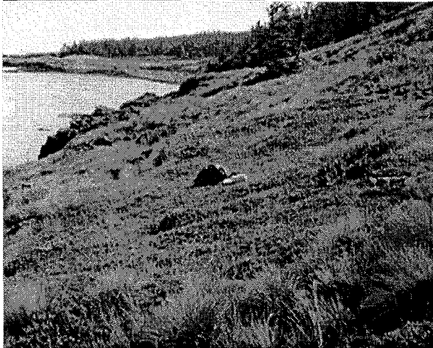
Photos 2 & 3. Headland habitat just south of White's Cove, where 100 to 200 plants of Glaucous Rattlesnake-root ( Prenanthes racemosa ) were discovered on August 18 th , 2002, growing in mats of Creeping Juniper ( Juniperus horizontalis ).