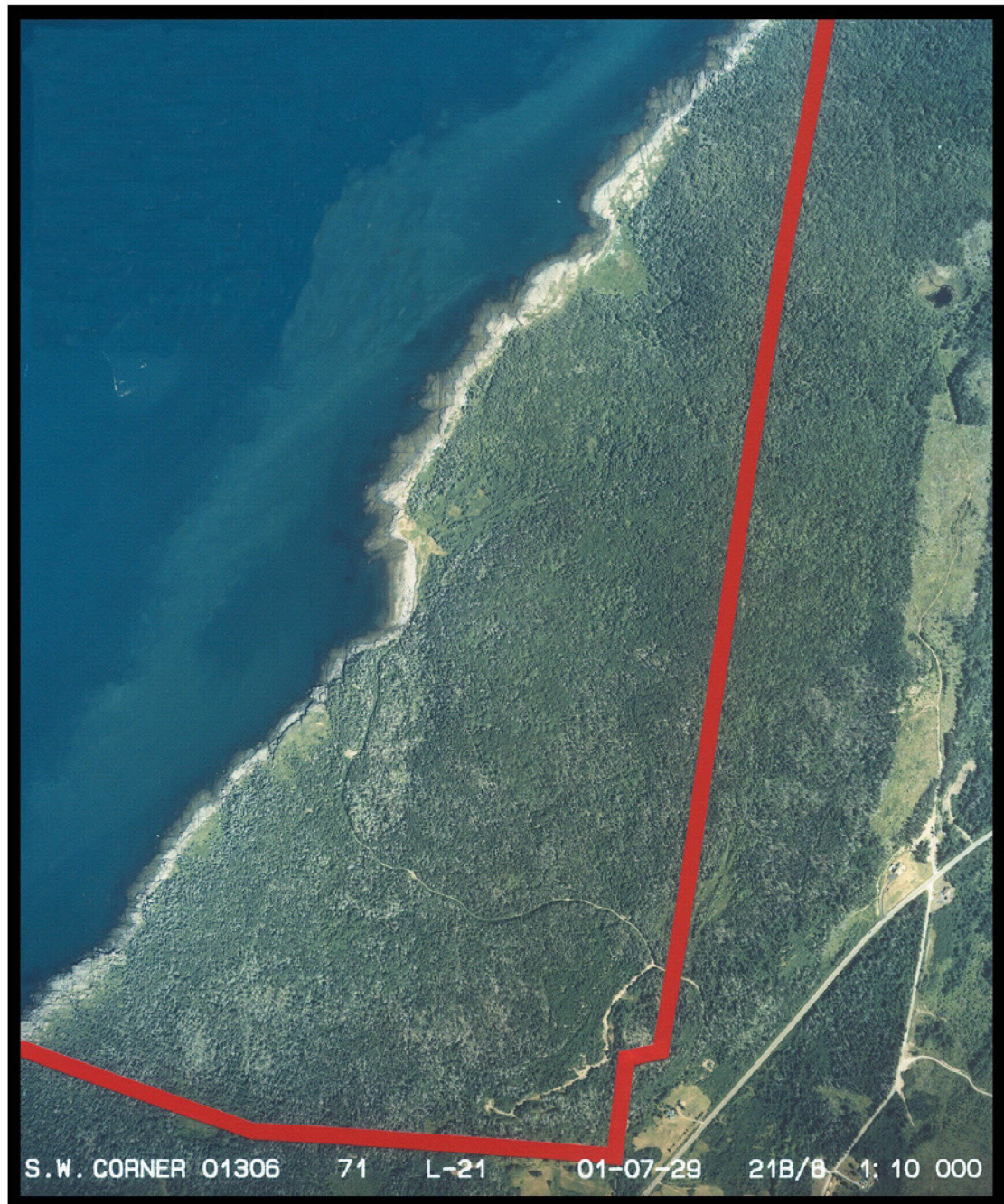
Figure 1. The Whites Point quarry property (2001 aerial photograph).