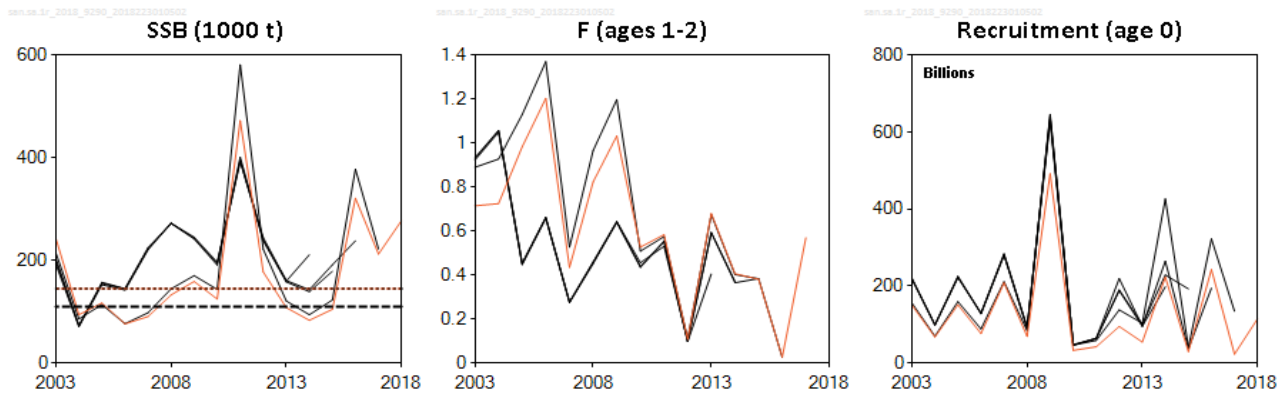
Figure 2 Sandeel in divisions 4.b–c, Sandeel Area 1r. Historical assessment results (final-year recruitment estimates included).