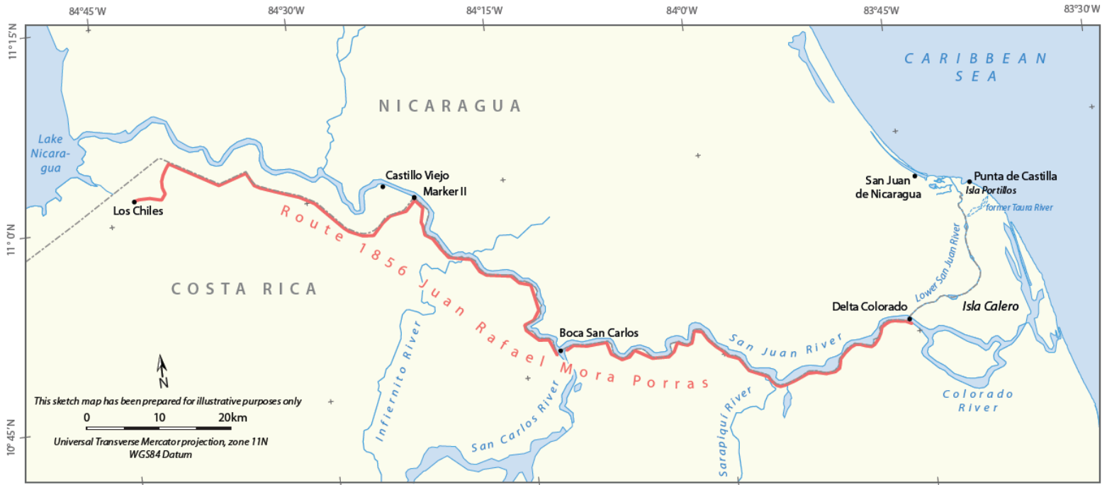
Sketch-map No. 2: Route 1856 Juan Rafael Mora Porras

CERTAIN ACTIVITIES AND CONSTRUCTION OF A ROAD (JUDGMENT)